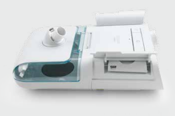
*Internal assessment of 2015 competitive CPAP data comparing to ResMed Airsense10/Aircurve10 platform and Fisher & Paykel Icon series platform.